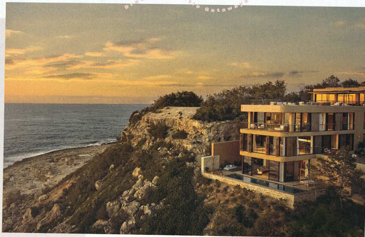
The Cliffhanger, a celebration-worthy five-bedroom villa at Six Senses Ibiza, in Spain.

Protravel International ( protravelinc.com ) who specializes in weddings and honeymoons. “International events are huge, but particularly in European destinations—in part because the euro is so weak that it offers great value,” he says.